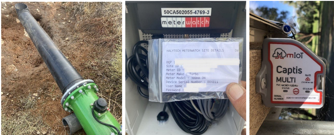
LID and Serial Number