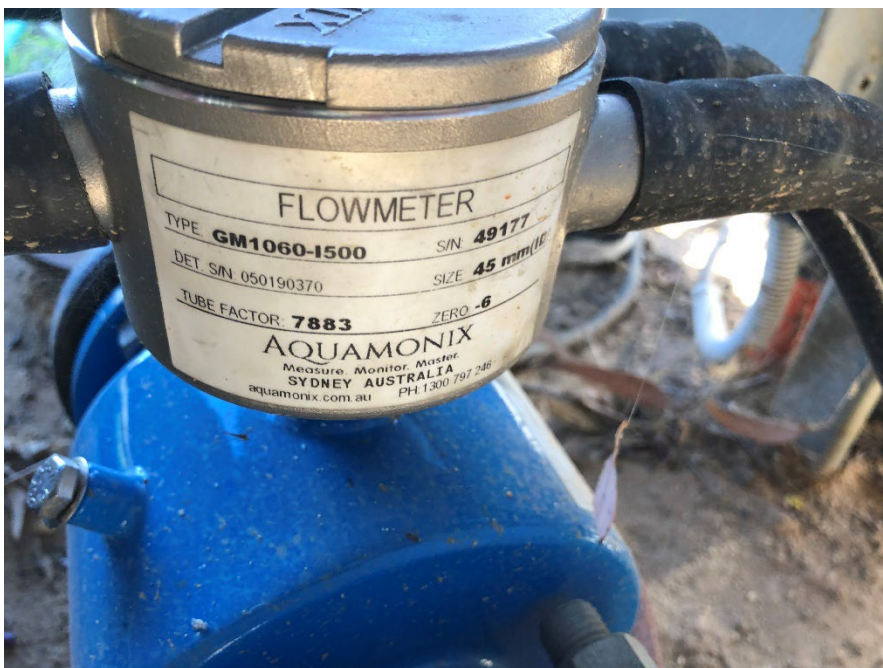
Meter identification label