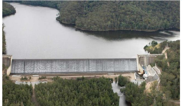
Tallowa Dam and fish lift on the right-hand side

No work is planned on Sundays or public holidays.