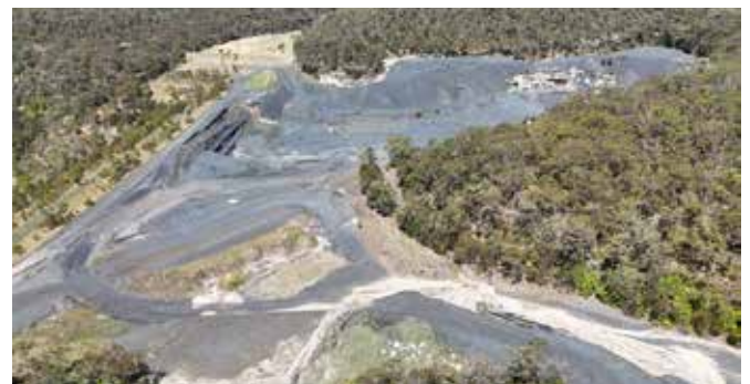
The Western Sydney Pumped Hydro Project by ZEN Energy would utilise a former colliery, in Nattai

For a full list of the program's Frequently Asked Questions, visit watnsw.com.au/renewableenergy .