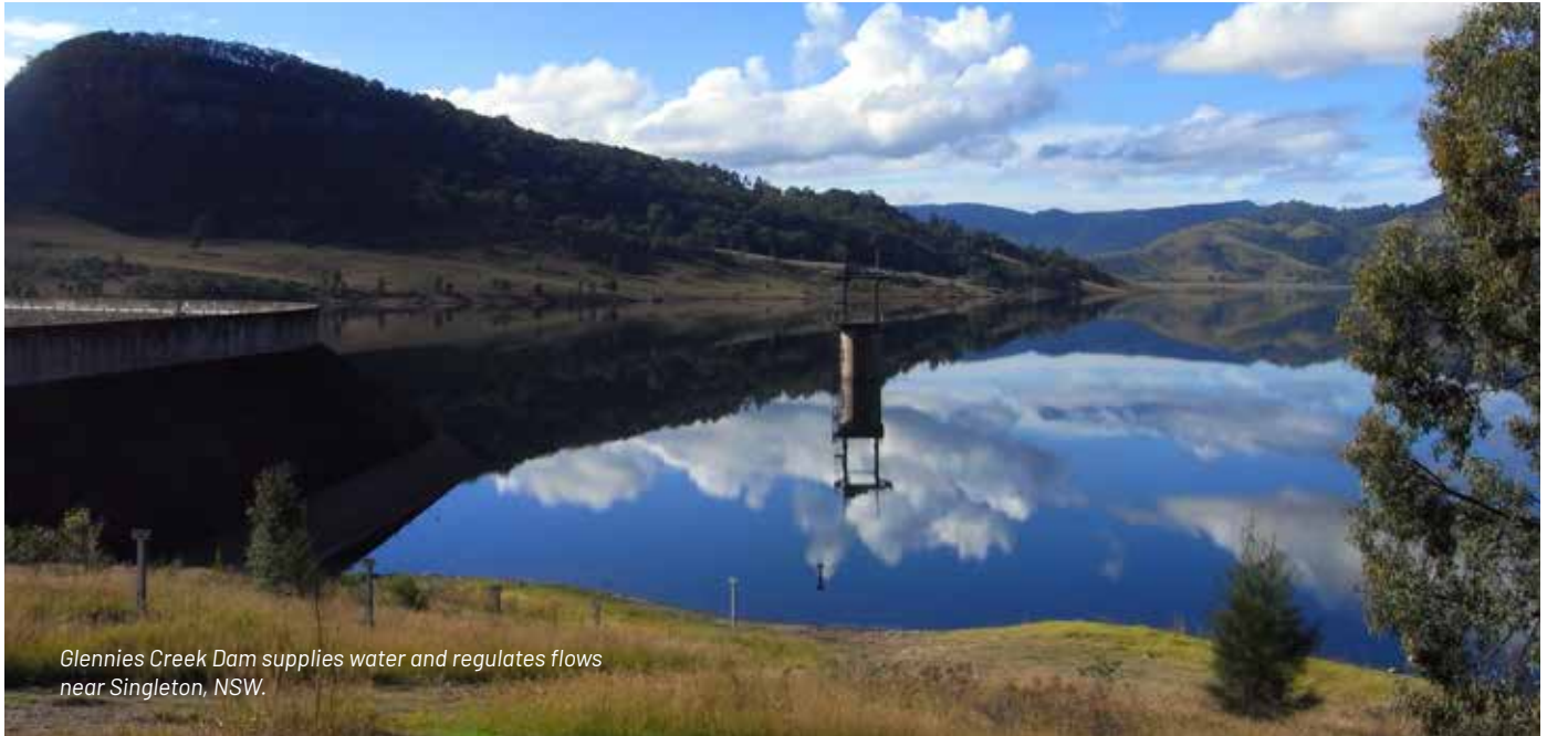
Glennies Creek Dam supplies water and regulates flows near Singleton, NSW.