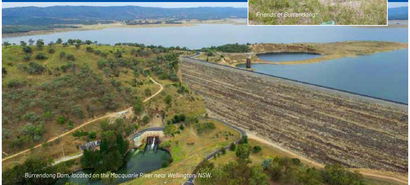
Burrendong Dam, located on the Macquarie River near Wellington, NSW.