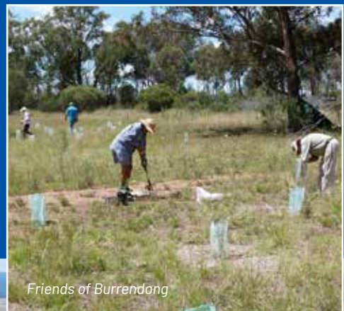
Friends of Burrendong

Some local events and organisations supported by the project include Friends of Burrendong Arboretum (pictured), Business Mudgee's Rural Women's Day Lunch, Mudgee Reader's Festival, Max Potential Mudgee, Mid-Western Working Horse Association Incorporated and Country University Centre- Mudgee.