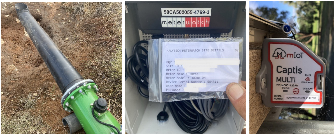
LID and Serial Number