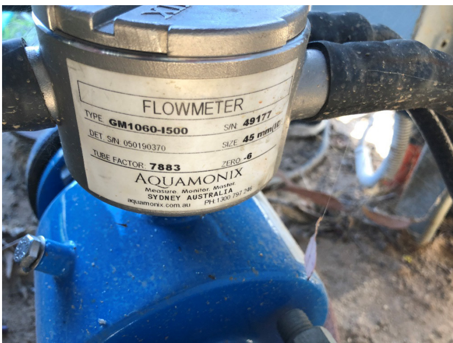
Meter identification label