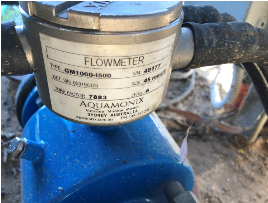
Meter identification label